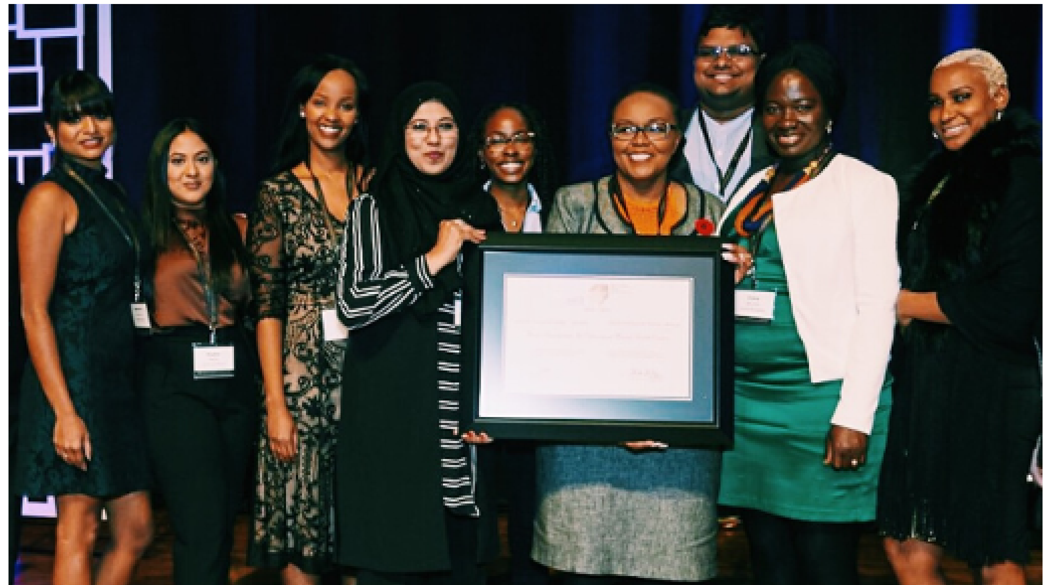
Across Boundaries accept the award for Accreditation Canada's, 'Accreditation with Commendation' award (2019-2024).

This article originally appeared on 680news.com